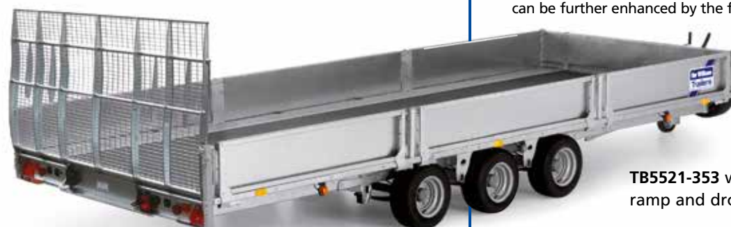
TB5521-353 with mesh rear ramp and drop sides.

In addition to the CT166 & 167 we have a new tiltbed series available offering six trailer models in a range of four lengths, two of which are available in a tri-axle version, and all offer a generous width of 2100mm (7'). Ideal for a range of vehicles including excavators and rollers. Please see our dedicated tiltbed brochure for more details.