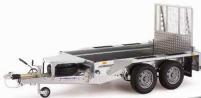
GX84 with ramp