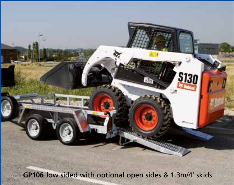
GP106 low sided with optional open sides & 1.3m/4' skids

Loading heights will vary slightly depending on tyre options.