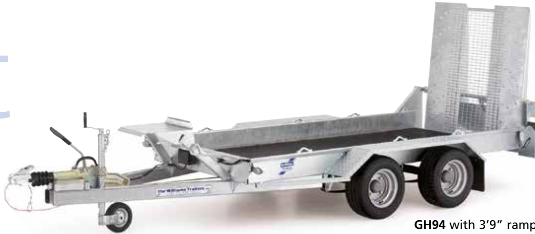
GH94 with 3'9" ramp