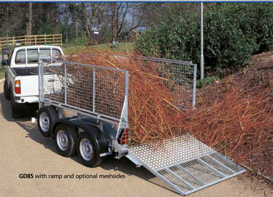
GD85 with ramp and optional meshsides