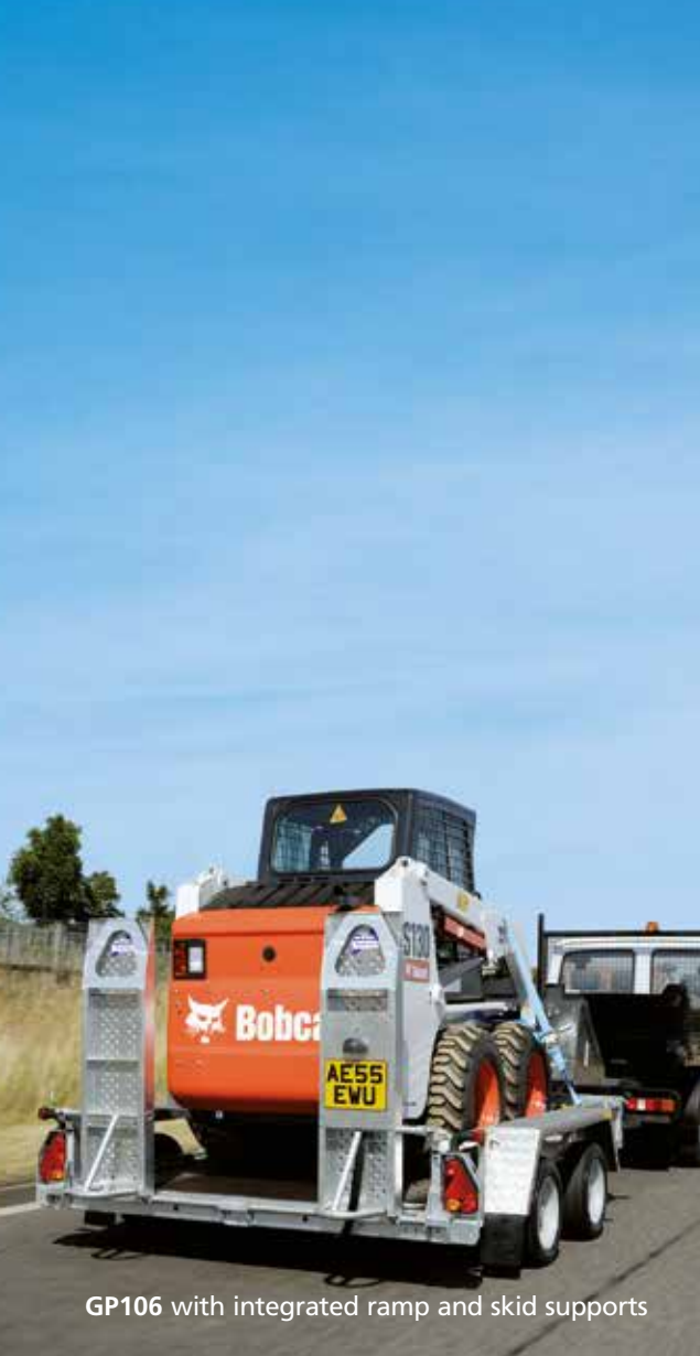
GP106 with integrated ramp and skid supports

Product design, descriptions, colours, specifications etc. correct at time of going to press. We constantly strive to improve our products, and from time to time this may result in changes to our range or to individual models. Please check that design, description, colours, specifications described in this brochure are still valid at the time of placing an order.