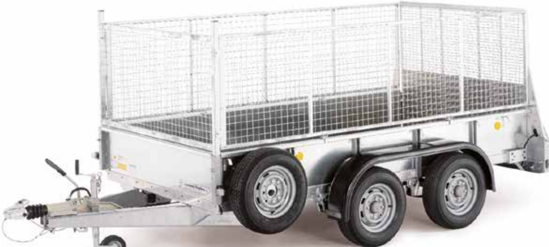
GD105 with ramp and optional meshsides