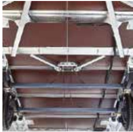
Chassis & floor

It's the attention to detail of Ifor Williams trailers that makes our products so popular with owners. Just take a look at these standard features.