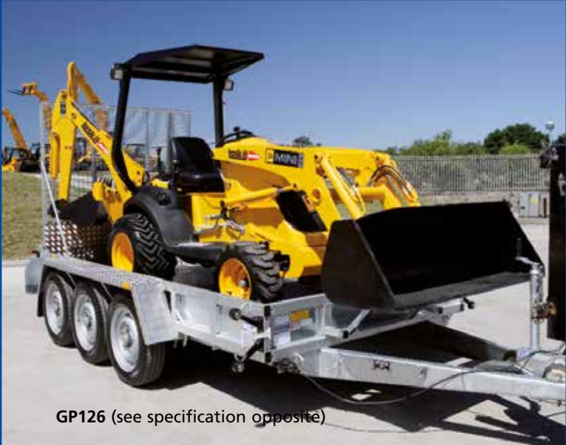
GP126 (see specification opposite)