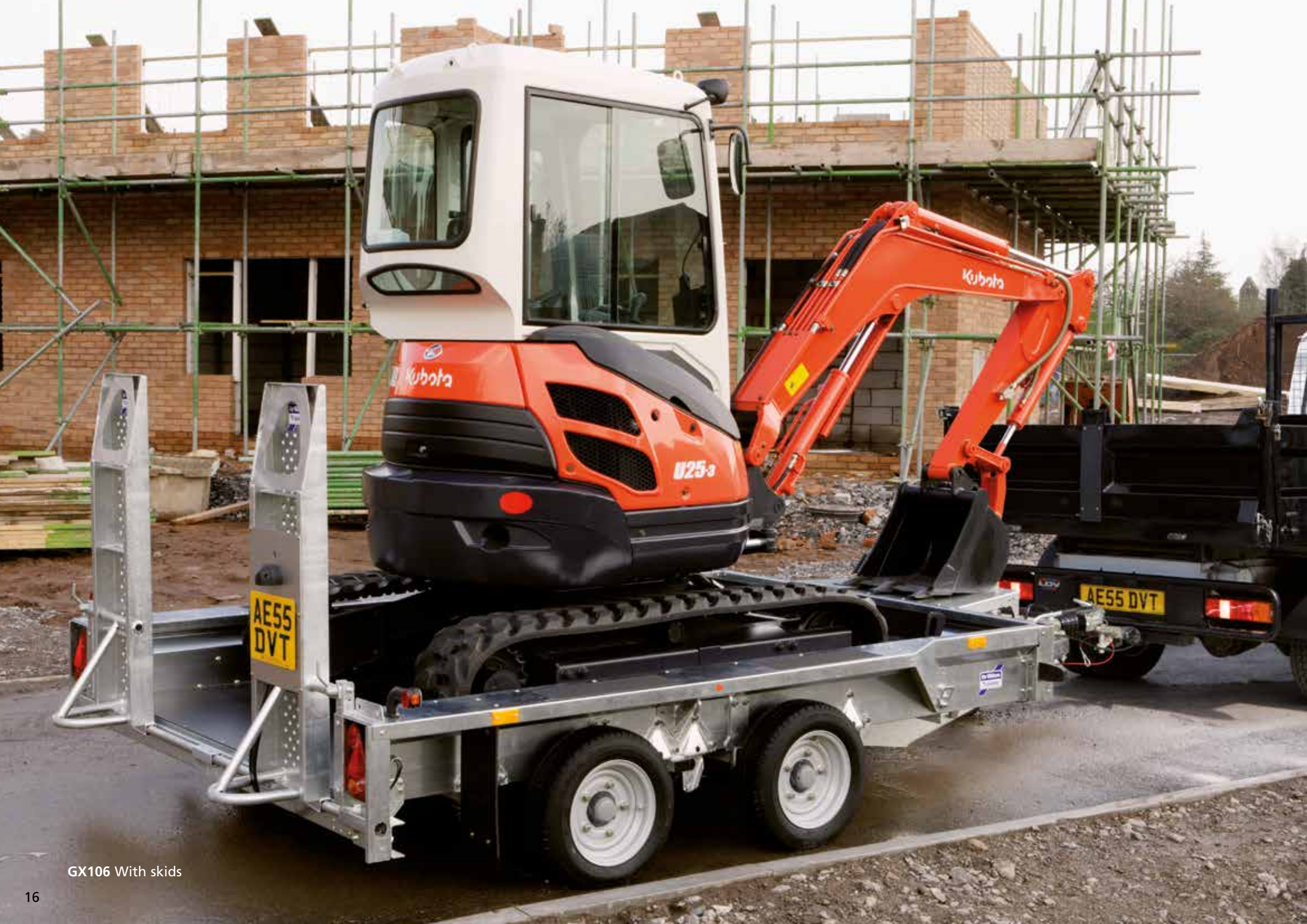
GX106 With skids