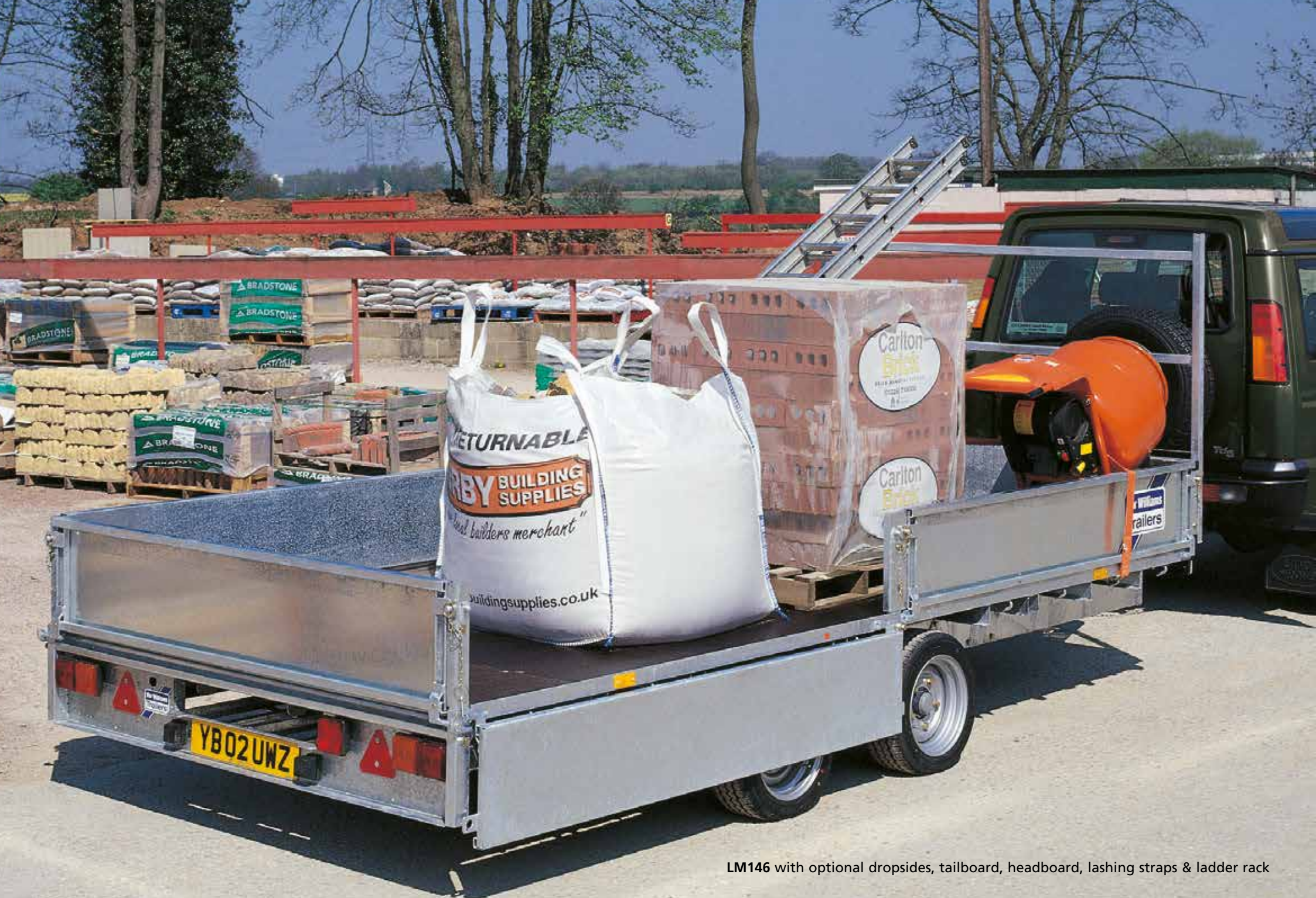
LM146 with optional dropsides, tailboard, headboard, lashing straps & ladder rack