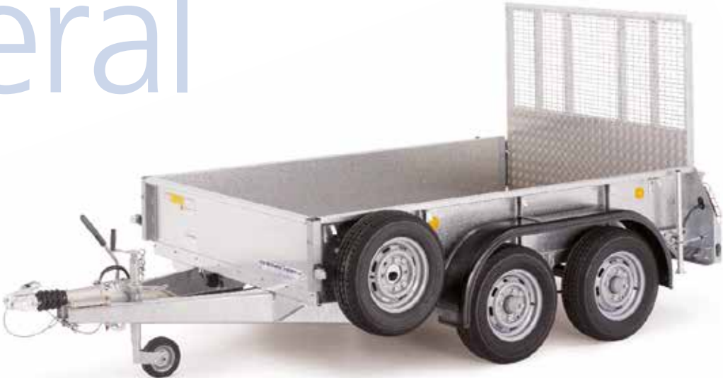
GD85 with ramp