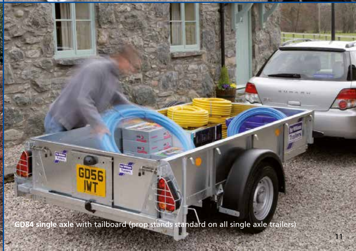
GD84 single axle with tailboard (prop stands standard on all single axle trailers)