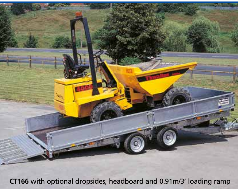
CT166 with optional dropsides, headboard and 0.91m/3' loading ramp