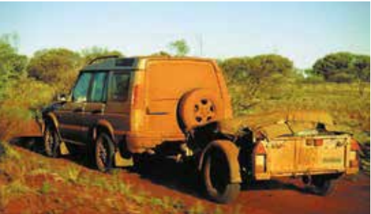
A GD64 at work in the Australian outback

Our General Duty trailers are at home in almost any environment, with virtually any type of load, from building materials to expedition equipment.