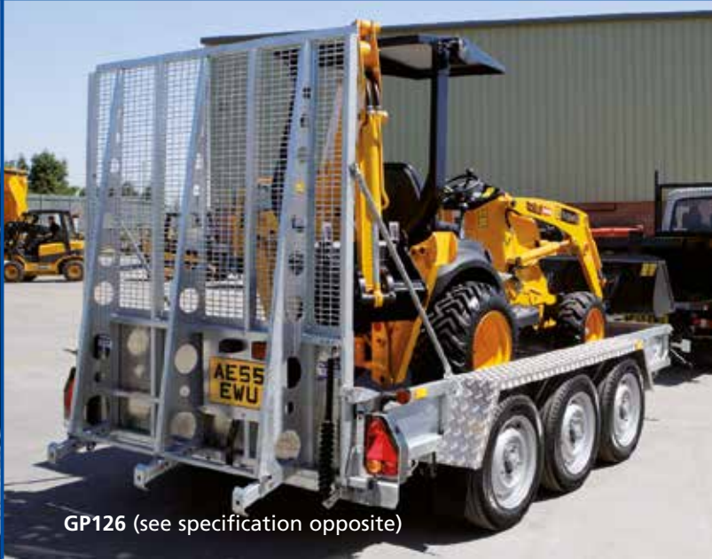
GP126 (see specification opposite)