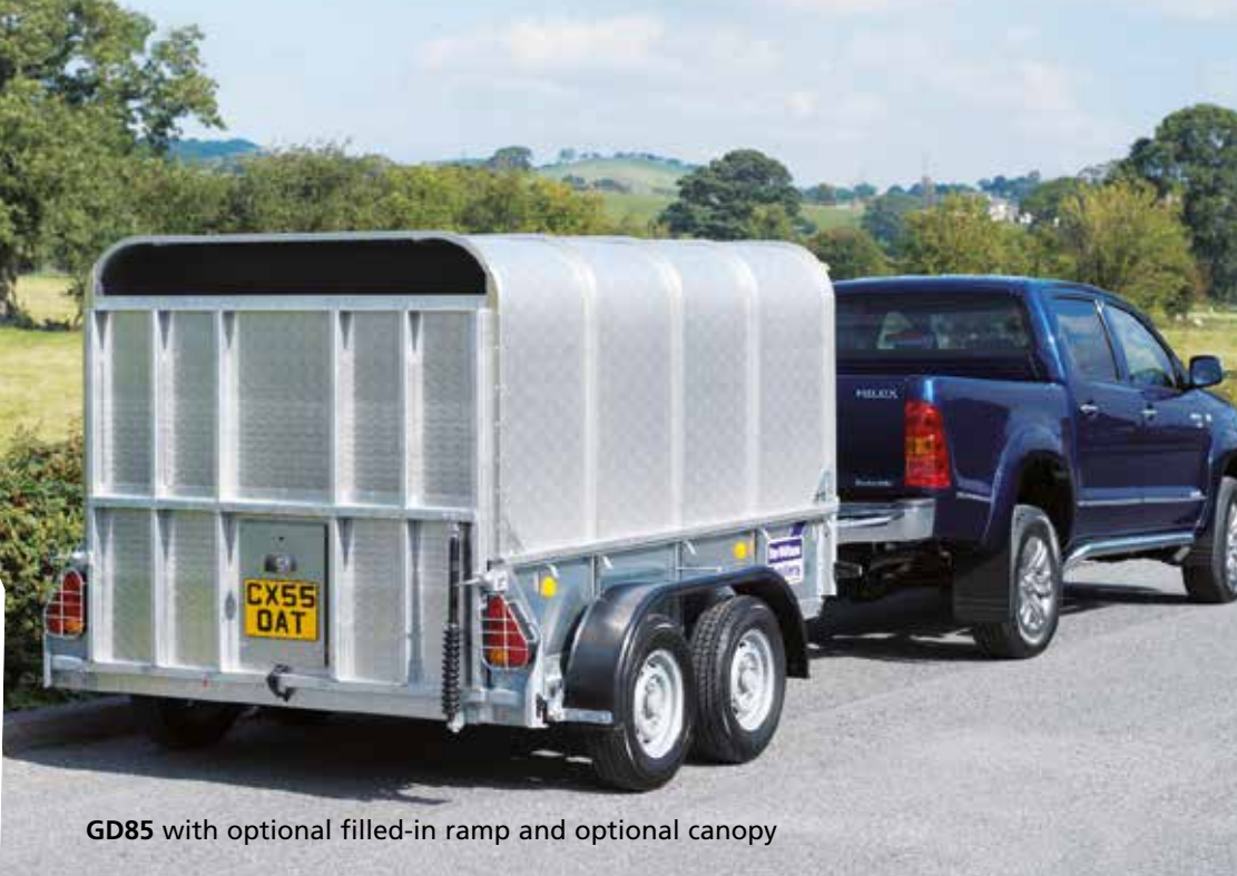
GD85 with optional filled-in ramp and optional canopy