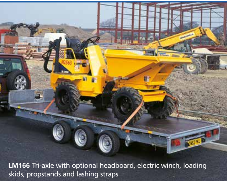
LM166 Tri-axe with optional headboard, electric winch, loading skids, propstands and lashing straps

The maximum gross weight for the LT model is 2000kg, whilst the heavier LM models offer between 2700kg and 3500kg.