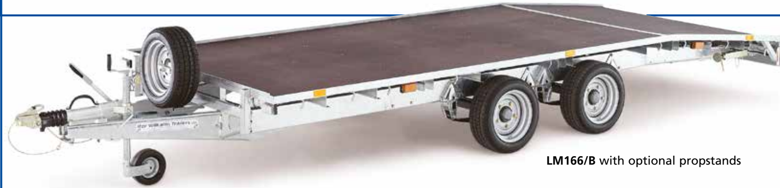
LM166/B with optional propstands

Vehicles with low ground clearance may not be suitable for loading on this type of trailer.