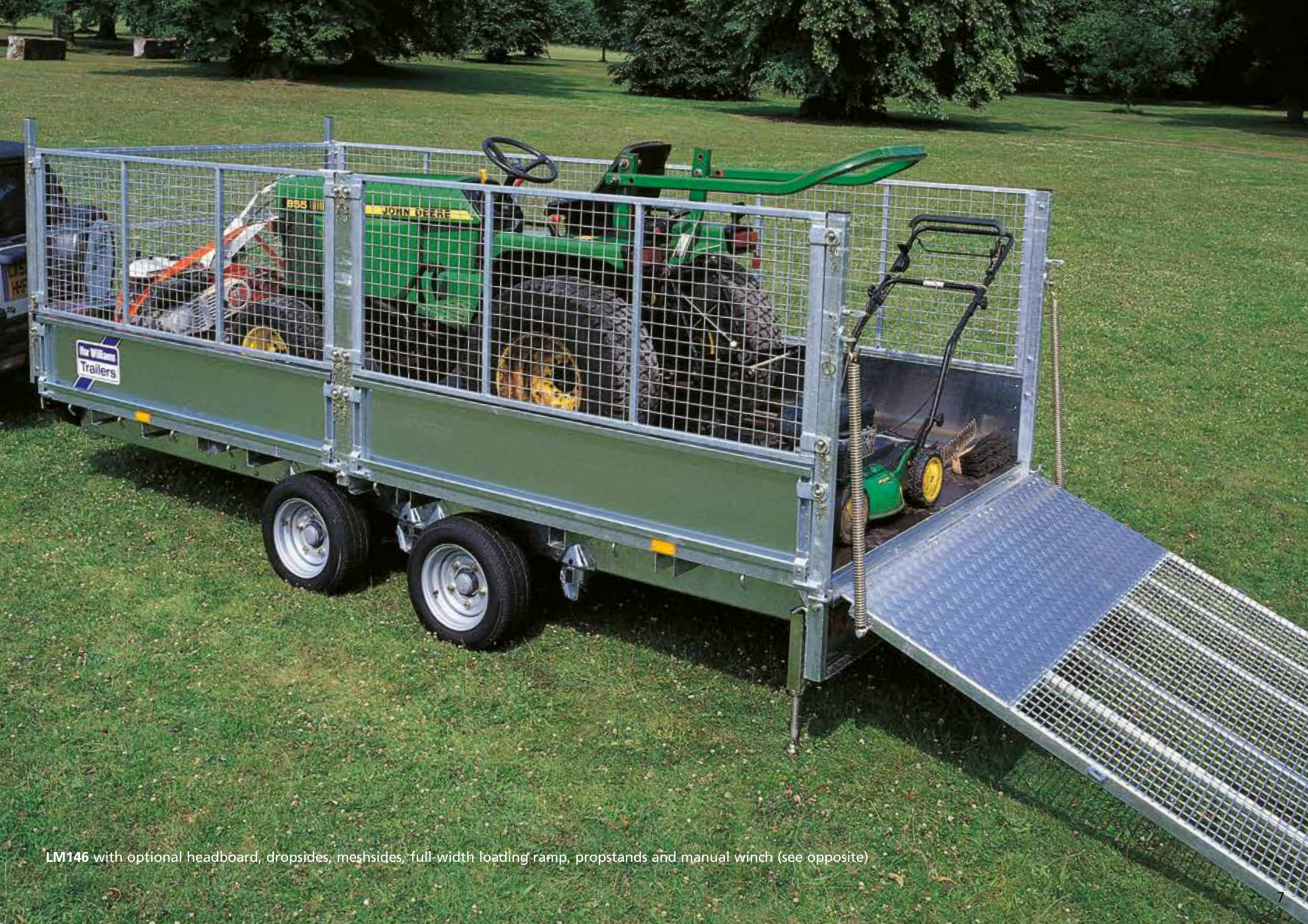
LM146 with optional headboard, dropsides, meshsides, full-width loading ramp, propstands and manual winch (see opposite)