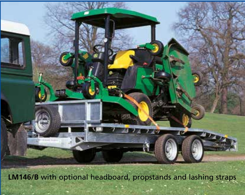
LM146/B with optional headboard, propstands and lashing straps