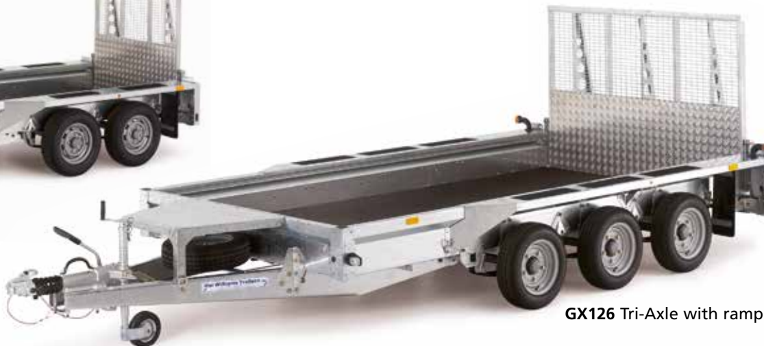
GX126 Tri-Axle with ramp