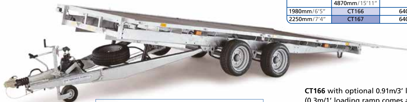
CT166 with optional 0.91m/3' loading ramp (0.3m/1' loading ramp comes as standard)