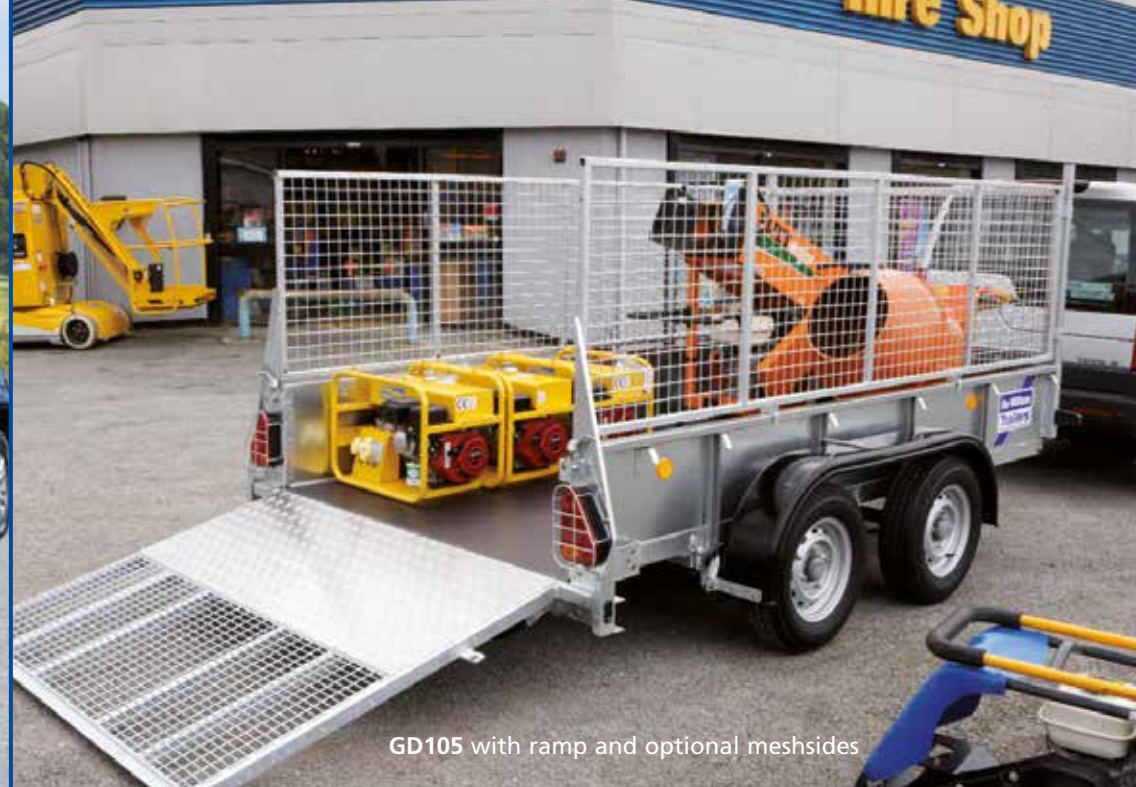
GD105 with ramp and optional meshsides