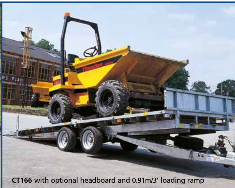
CT166 with optional headboard and 0.91m/3' loading ramp

For owners of vehicles with low ground clearance or those in the vehicle recovery business, the tiltbed is an ideal choice. It provides all the benefits of the flatbed range, combined with an easily-tilted platform for effortless loading.