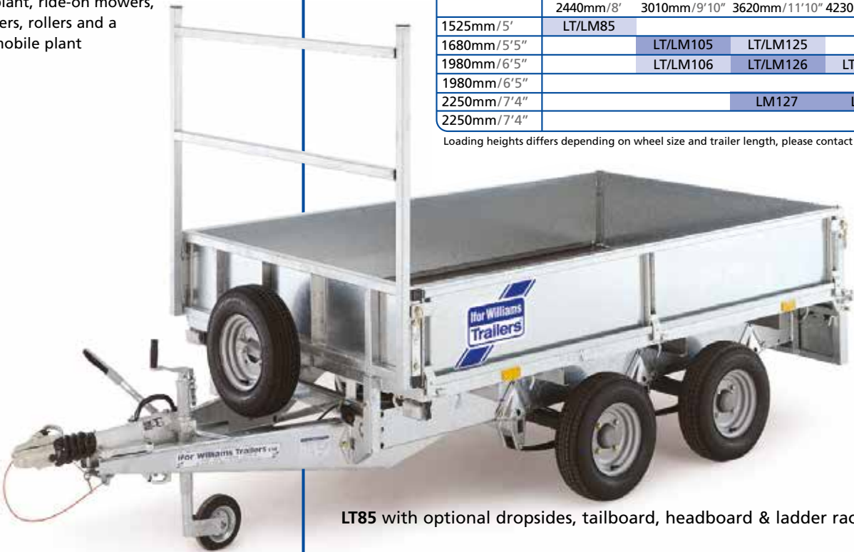
LT85 with optional dropsides, tailboard, headboard & ladder rack

Loading heights differs depending on wheel size and trailer length, please contact your local distributor for more information.