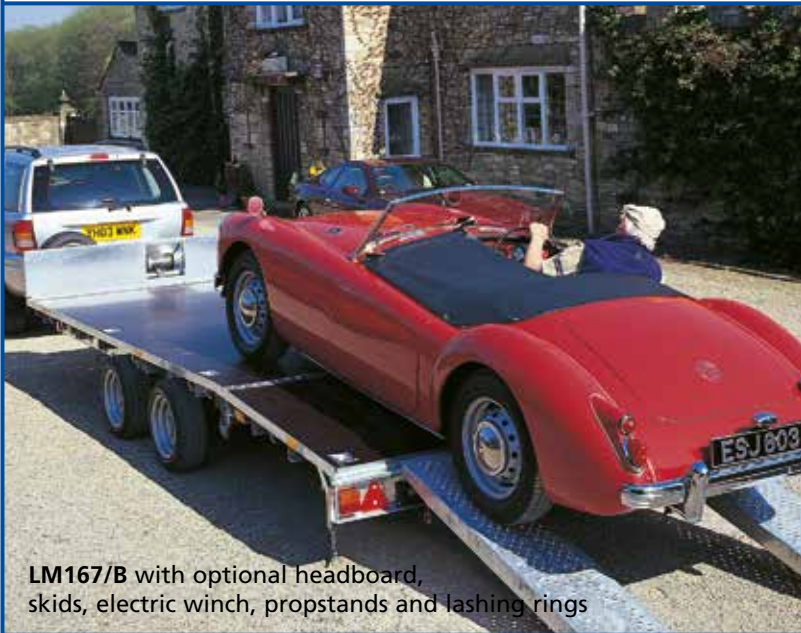
LM167/B with optional headboard, skids, electric winch, propstands and lashing rings