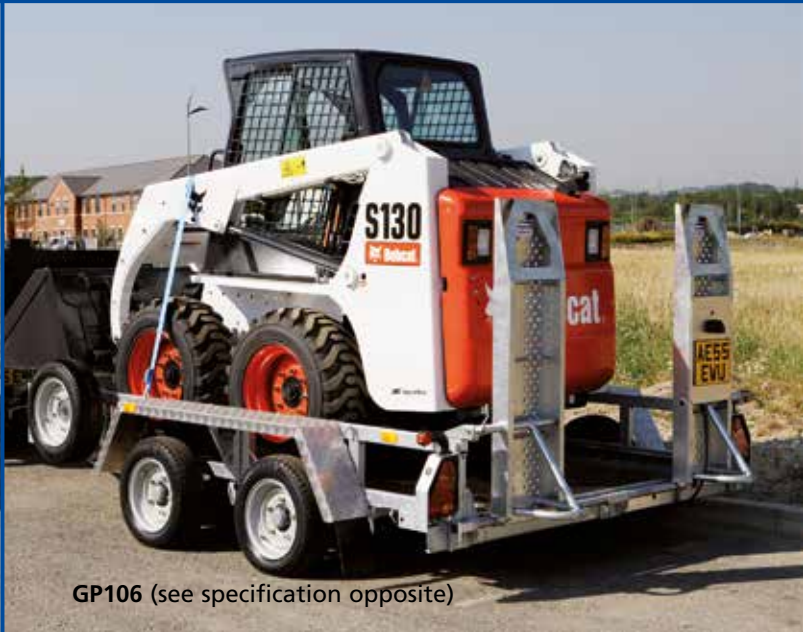
GP106 (see specification opposite)