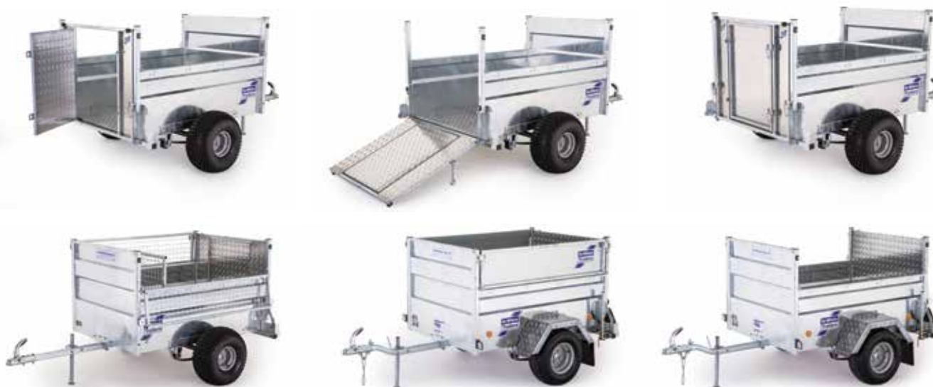
Q5 Q5e off-road and road versions showing different ramp, hinged sides and internal partition options