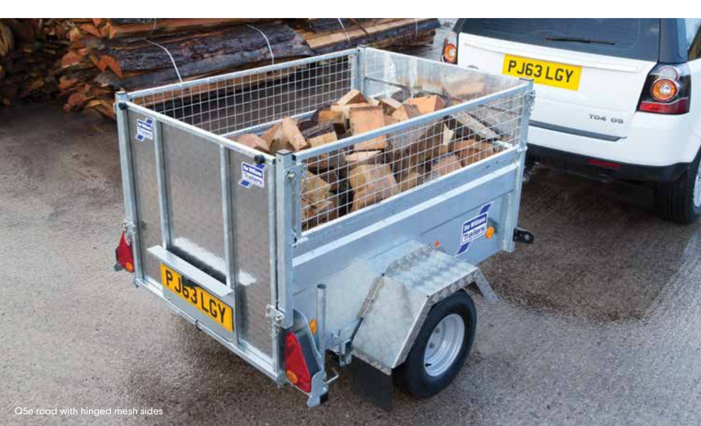
Q5e road with hinged mesh sides