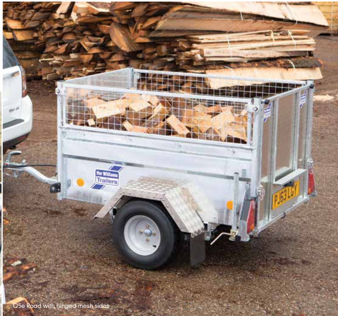
Q5e Road with hinged mesh sides

*Please check towing vehicle manufacturer's handbook for maximum unbraked towing limit.