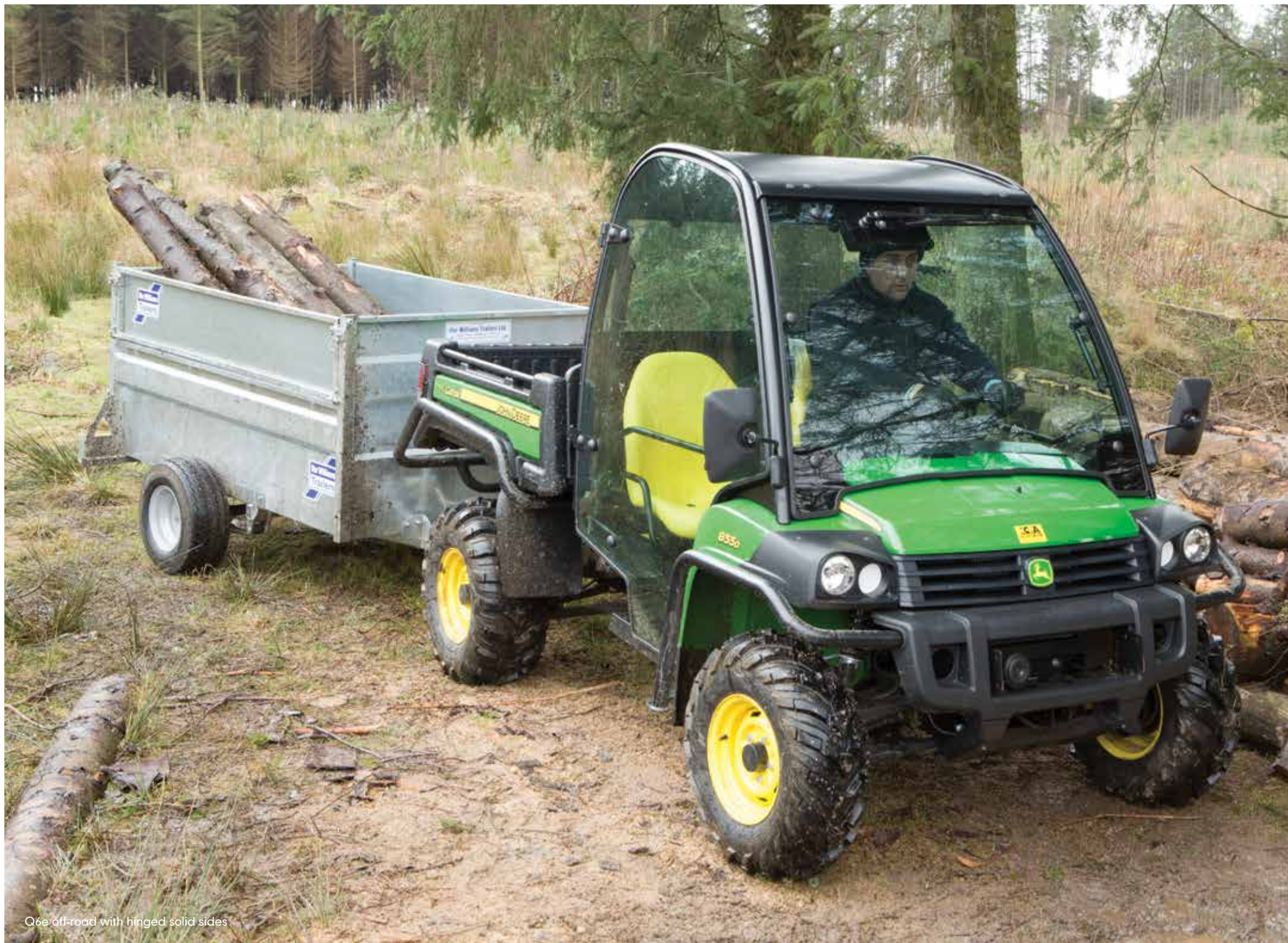
Q6e off-road with hinged solid sides