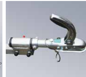
Swivel Hitch option available for off road use only (Not type approved for road use*)