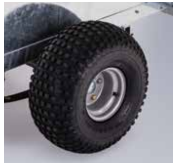
Q5e off-road knobby tyres (22 x 11-8)