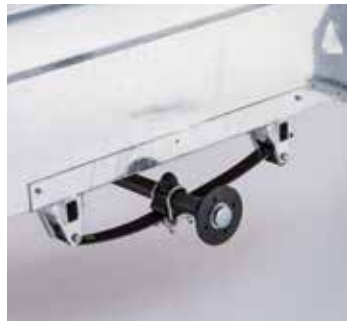
Leaf spring suspension is standard