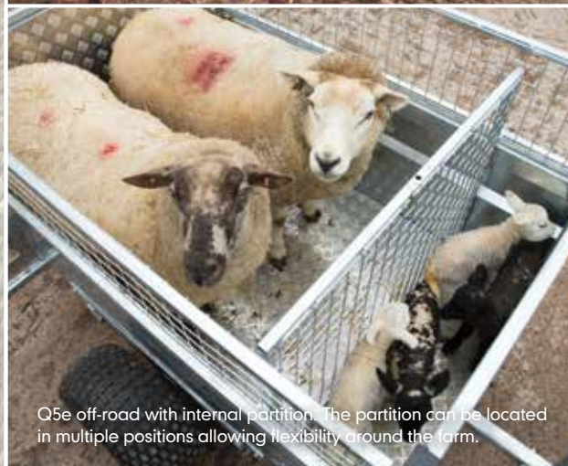
Q5e off-road with internal partition. The partition can be located in multiple positions allowing flexibility around the farm.