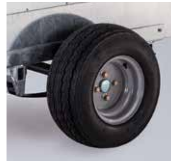
Q5/6/7e off-road flotation tyres (20.5 x 8-10)