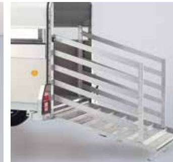
Optional ramp gates available on Q6, 7 and 8