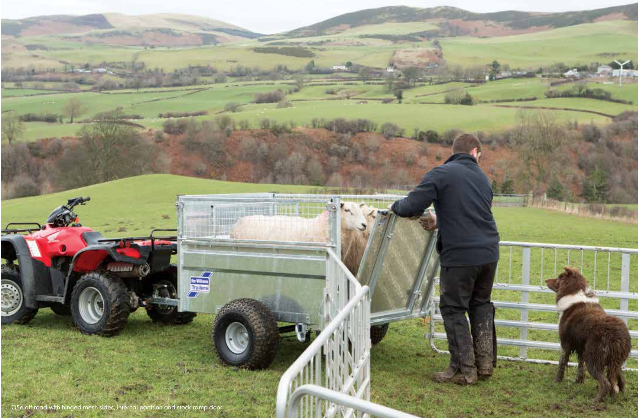
Q5e off-road with hinged mesh sides, internal partition and stock ramp door