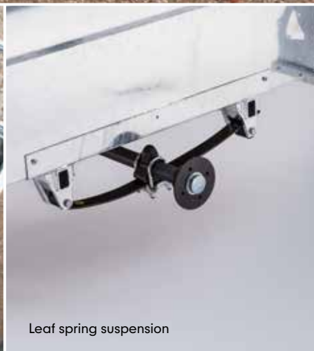
Leaf spring suspension