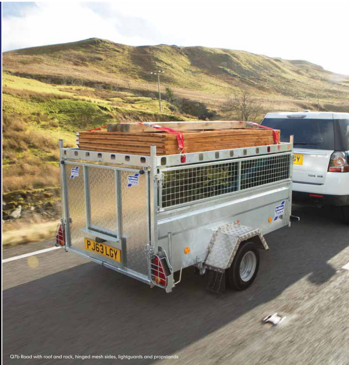
Q7b Road with roof and rack, hinged mesh sides, lightguards and propstands

We are an independent company with one focus: to build the best products on the market. More than 30,000 people choose our trailers each year – but we are not standing still. Our dedicated investment in new technologies and materials ensures that our products continue to exceed the expectations of our customers. We know that quality, strength, value and ease of maintenance are of vital importance to you. That is why we have made them the driving force behind everything we do.