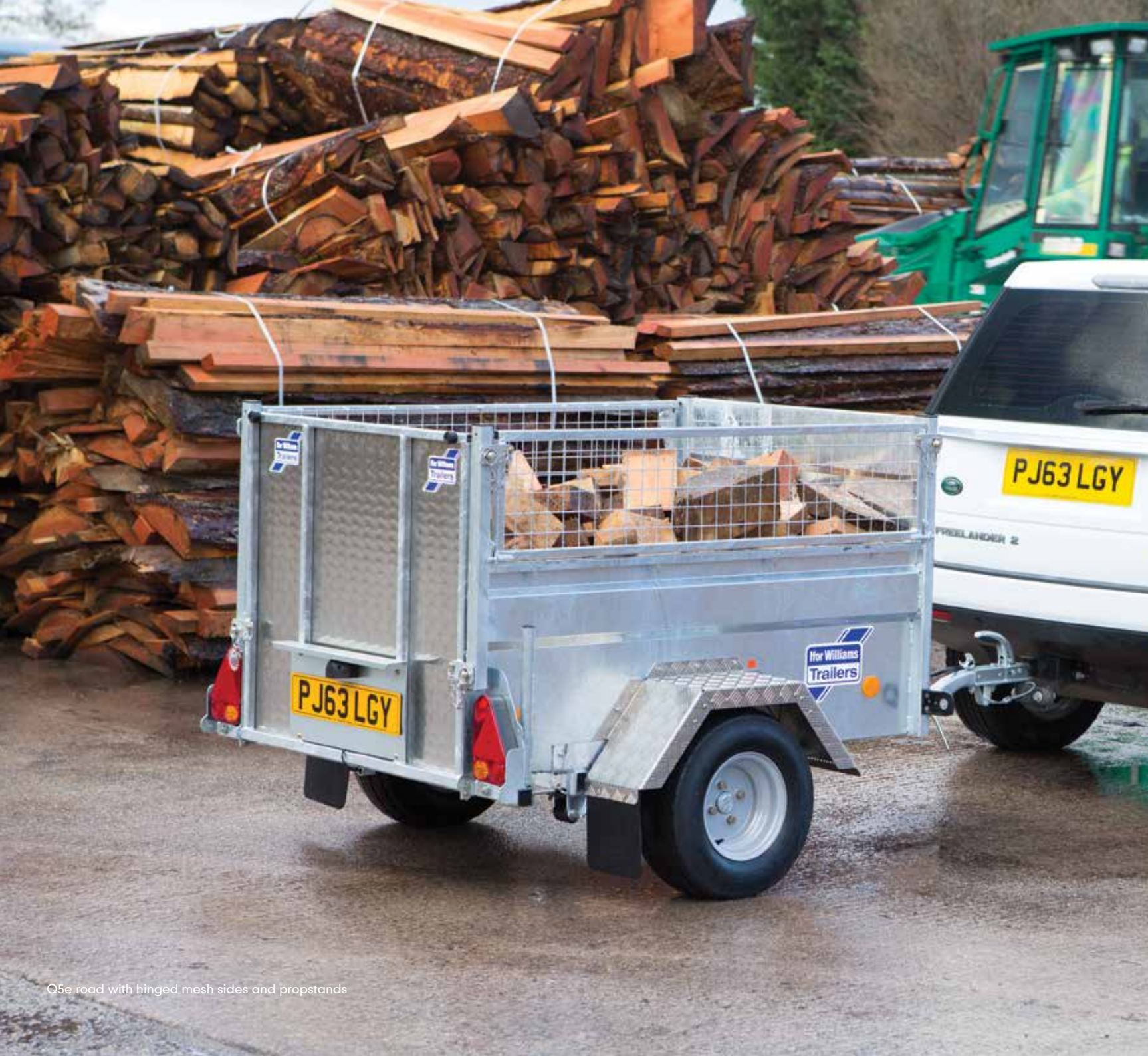
Q5e road with hinged mesh sides and propstands