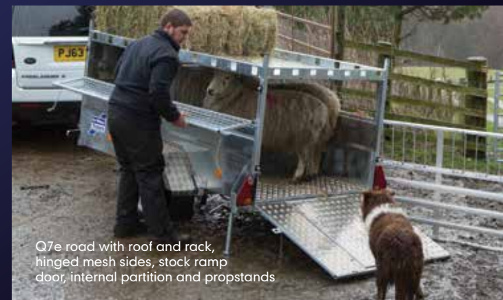
Q7e road with roof and rack, hinged mesh sides, stock ramp door, internal partition and propstands

* The roof and rack has a maximum recommended weight of 50kg and uses two fasteners which are easily removed.